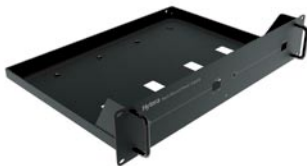
Bracket (2U) BRK12

The following items are the main optional accessories for the product, and please consult your local dealer for more other accessories.